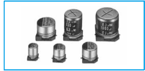
Marking color : Black print ( \phi 4 \times 5.3L - \phi 8 \times 6.5L, \phi 12.5 \times 13.5L ) : White print on a brown sleeve ( \phi 8 \times 10L - \phi 10 \times 10.5L )